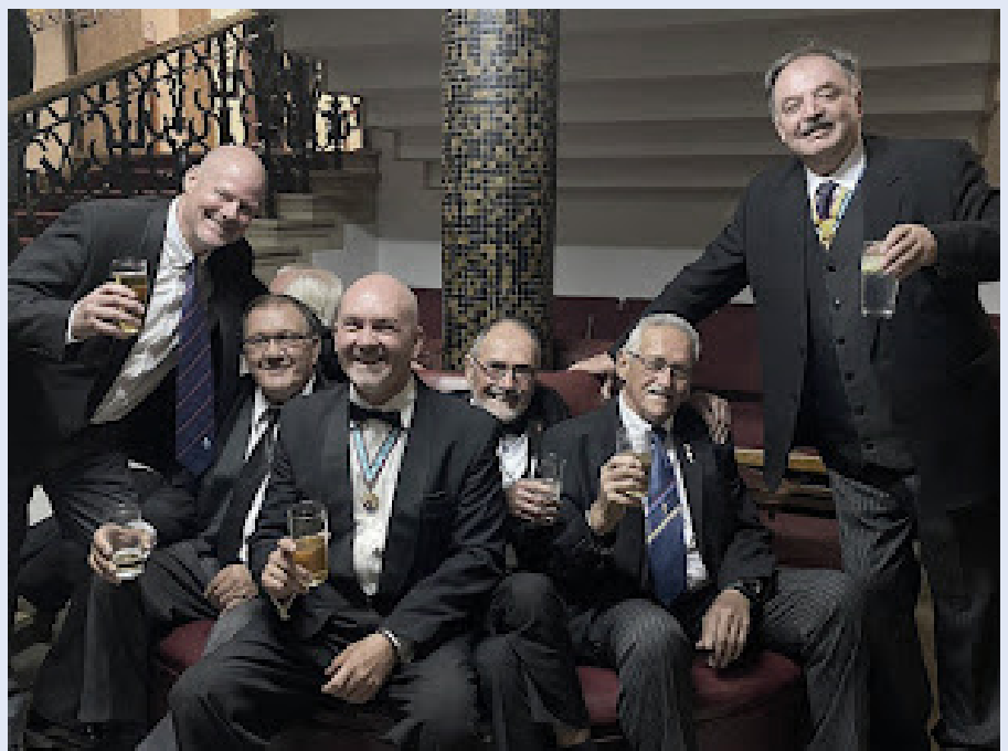
Members of Prosperity and Doornfontein Mark Lodges in serious discussion following the 2022 AGM