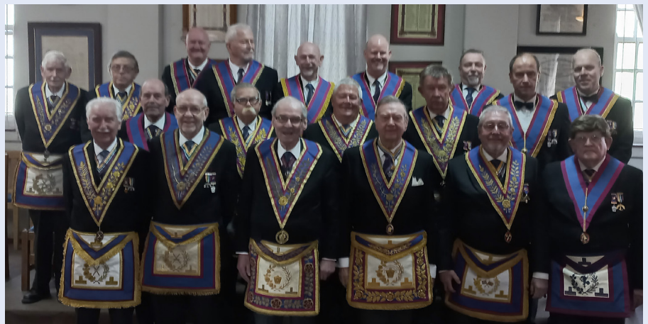
Grand Officers and District Grand Officers present at the re-opening of King Edward Mark Lodge July 2022