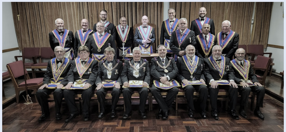
Prosperity Mark Lodge Installation 22 March 2023